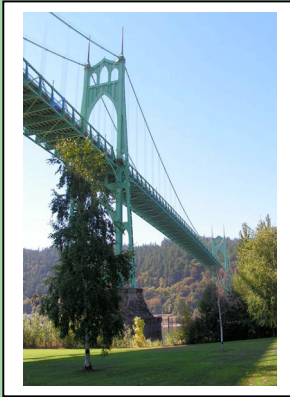
OUR FABULOUS ST. JOHNS BRIDGE.